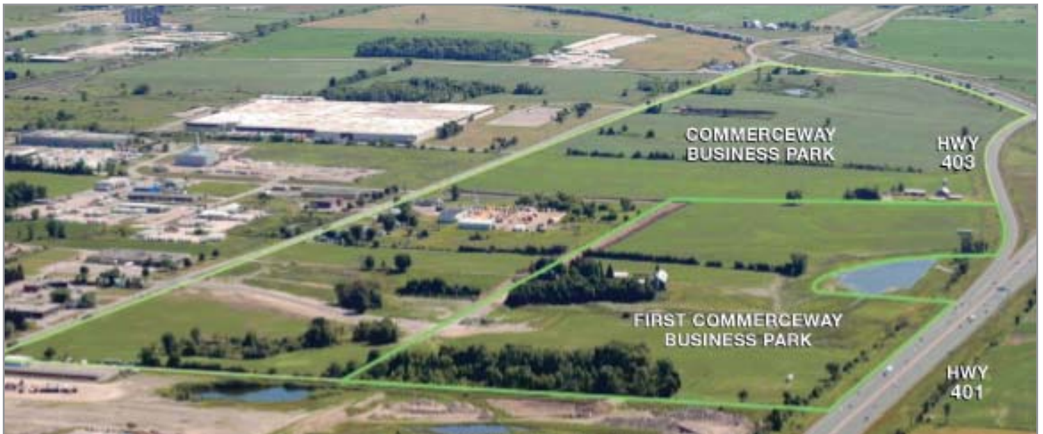
Strategically located at the intersection of Highways 401 and 403, CommerceWay Business Park offers tremendous exposure along Highway 401 with easy access to both major highways.

First Gulf’s industrial client list includes companies such as the Clorox Company of Canada, Western Waffels, CAMCO, Hunter Douglas Canada, Brewers Retail and El-En Packaging Co. Ltd. to name only a few.