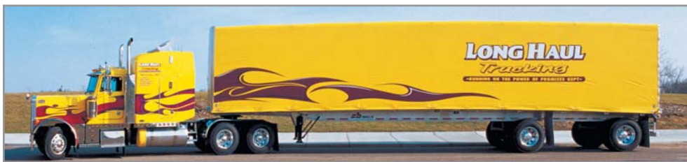
Till-Fab manufactures retractable tarp systems for flatbed transport trailers under the brand name Roll-Tite.