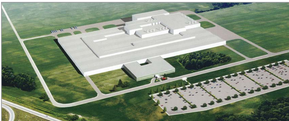
An artist's conceptual drawing of the future home of Toyota's new manufacturing plant shows its location northeast of Oxford roads 2 and 4 and just northwest of Highway 401.

" This project has been a textbook example of cooperation between various levels of government, " noted Woodstock Development Commissioner Len Magyar. "City and provincial staff have committed thousands of person hours to guarantee that Toyota had all of the information required to make a decision in favour of a Woodstock location. City and County Councils have worked together to assemble the land required to facilitate such a site, and senior management at all levels have worked together to ensure that the only logical answer to a Woodstock site was yes. "